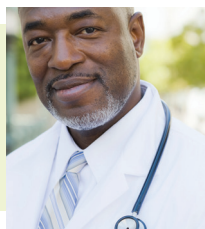
Image content features models and is intended for illustrative purposes only.

Ask your doctor about hepatitis C testing by Quest Diagnostics